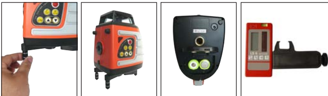
LS-6 Laser Detector LA-6Q Quick clamp

Standard outfit:main unit,laser detector with clamp,target plate, rechargeable batteries and charger,instruction manual,plastic case.