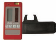
LS-6 Detector LA-6Q Quick clamp